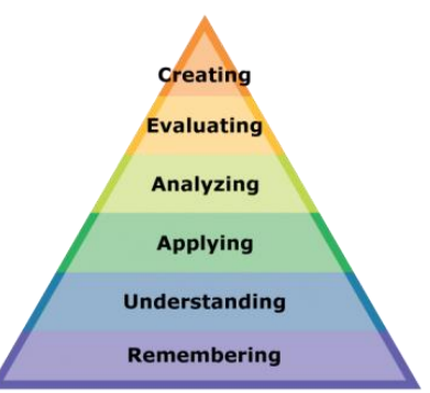
Figure 3 Bloom's Taxonomy

Creating: Students gain the ability to incorporate opinions suggested by group members, thereby forming a novel viewpoint.