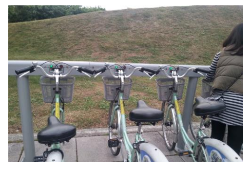
The bike that you can borrow at MRT station.

Thirdly, Taiwan has the MRT system. It is a kind of subway. But MRT and subway are a little different. MRT users have a MRT card. It is very convenient. If you have one, you can use any public transport at a discounted price. Also, if you have one, you are allowed to use a bike provided by MRT for free. You can borrow the bike from where you get off the MRT and ride the bike to your destination. It enables you to get around the city easily. Surprisingly, my host family said "MRT is not convenient." Then, I said "The train in our hometown is much more inconvenient