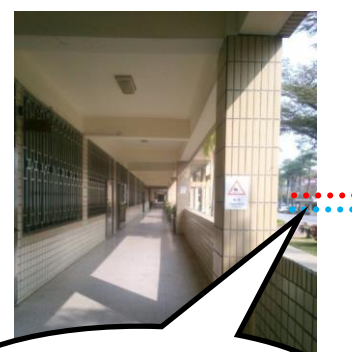
A side corridor facing outside has no wall and windows.

The students don't change their shoes when they come into the school. So, there are no doors at the main entrance.