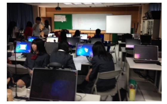
This is a picture of a computer room. All the computers are set facing forward.