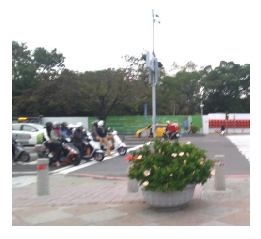
Many motorcycles are stopping at a traffic light.

First, Taiwanese people usually use motorcycles, while Japanese people usually use cars. I think one reason for this is that there are many night markets in Taiwan. People cannot go into the market by car because the streets there are very narrow. In addition, a lot of women ride on their motorcycles in Taiwan, while not so many Japanese women do so. I was so surprised to see women of all ages riding motorcycles, such a view is rare in Japan.