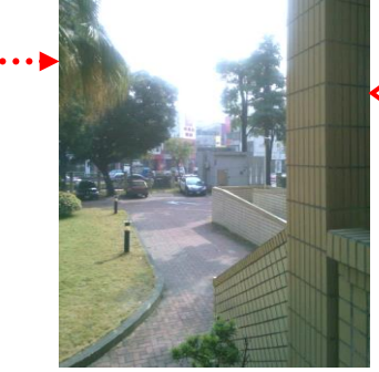
We can look at the beautiful city view.